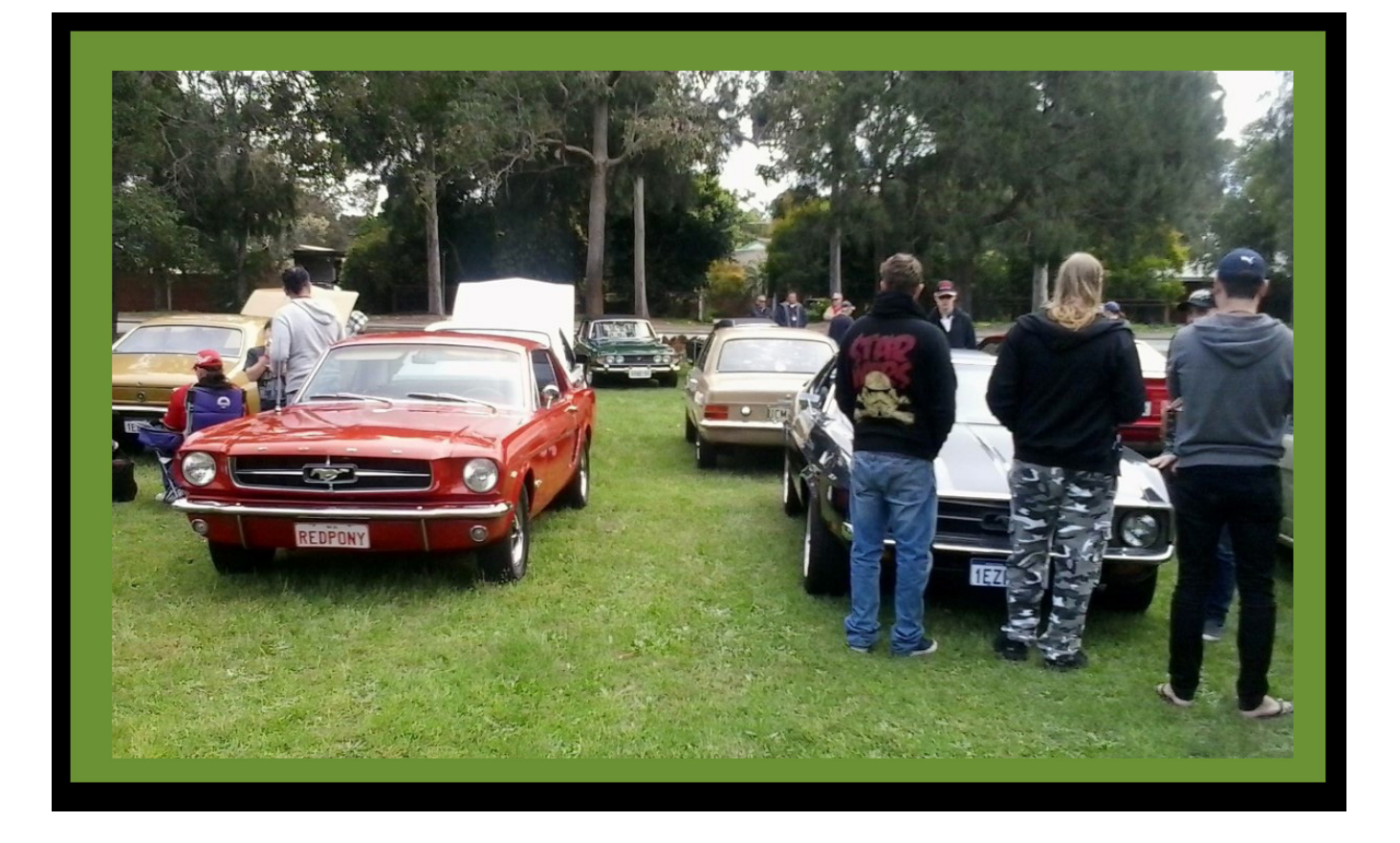
A couple of Mustangs were alongside us.